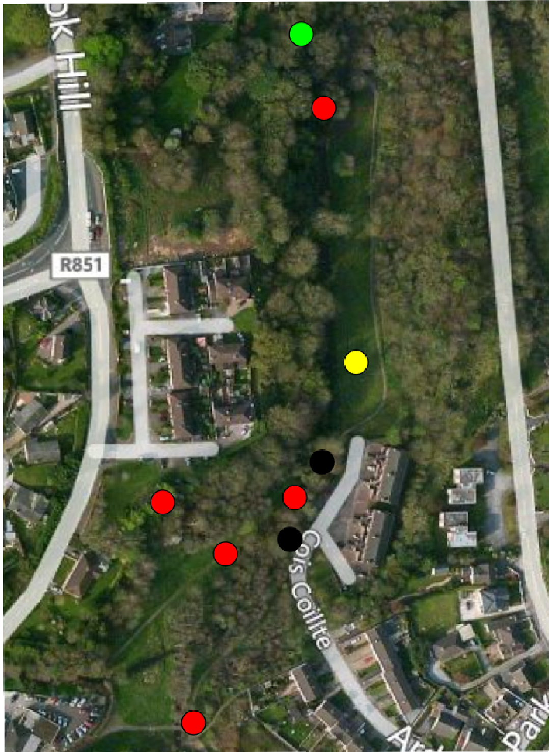
Fig. 1: Results of bat survey of Ballybrack river valley, Douglas, Co. Cork. Red dots represent records of soprano pipistrelle, green dots represent records of common pipistrelle, yellow dots represent records of leisler's bat and black dots represent records of Myotis spp.